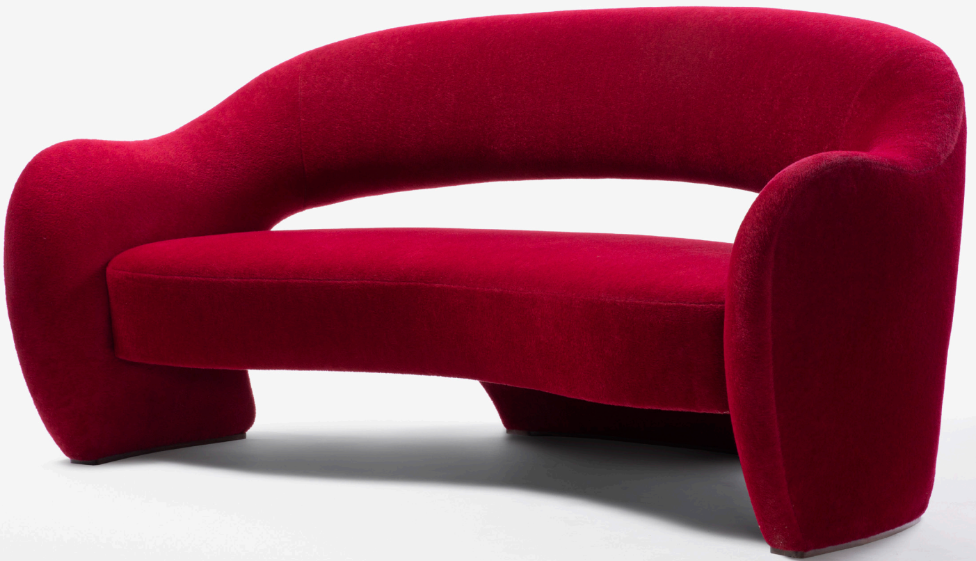
Wysiwyg Loveseat Model - 214 | Designed 2018